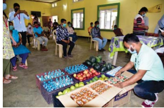
Covid relief distribution by local MLA