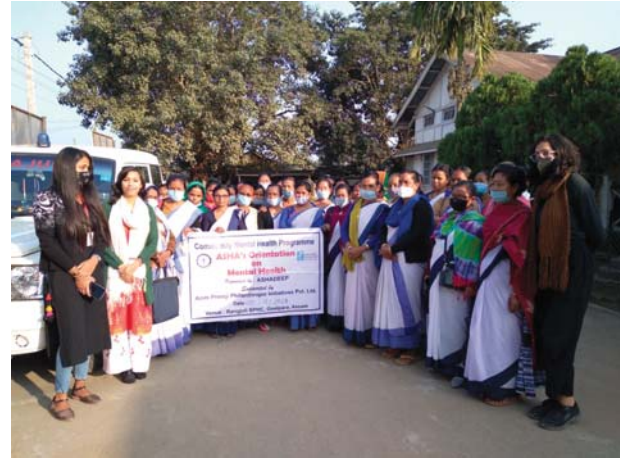
Training of ASHA workers