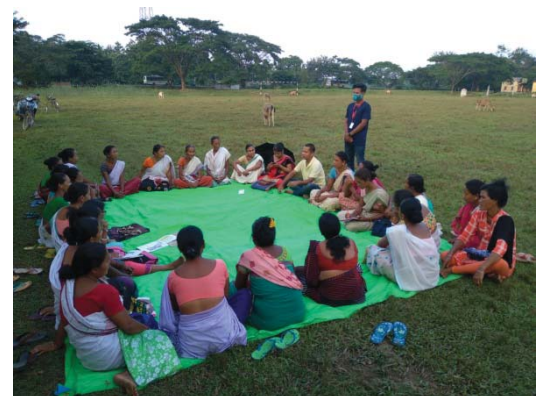
Community awareness programme