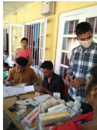
Psychiatric OPD at Rangjuli Block PHC