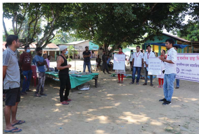
Street Play on the occasion of World Mental Health Day at Rangjuli