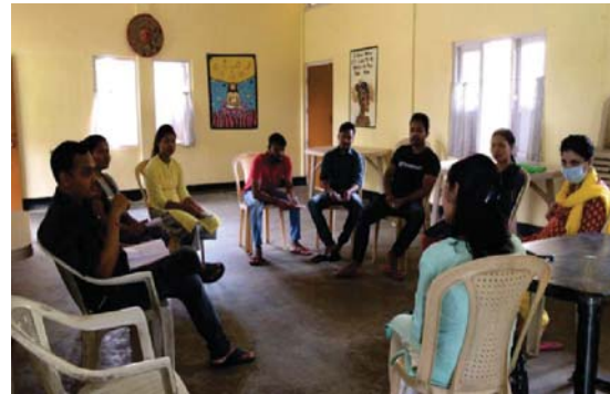
Training of resident Staff