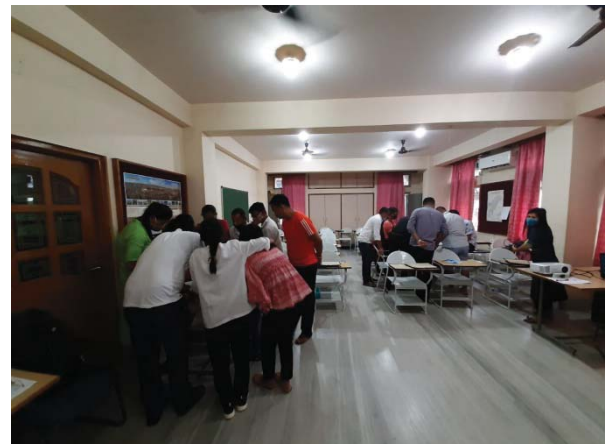
Combined training programme of three sites, clockwise – the participants, a training session, Role Play, Group activity