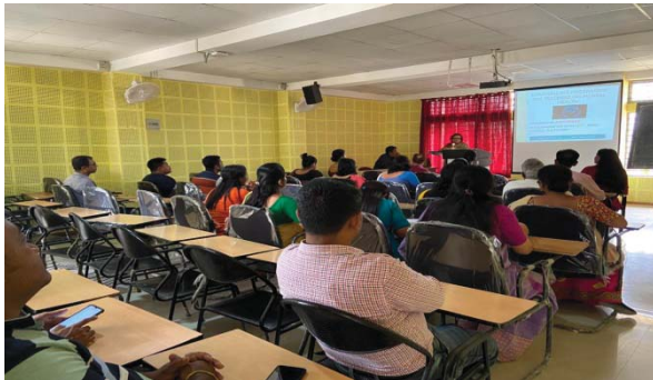
Sensitization of faculty members of Bikali College