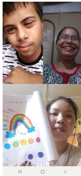
An Online session involving a day resident, trainer and an intern