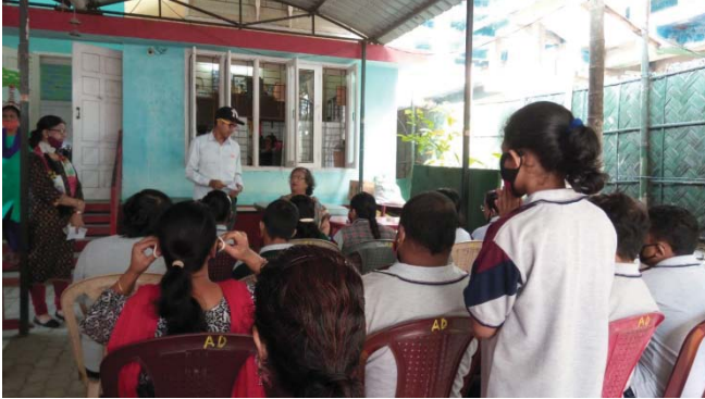
Awareness session on Covid Protocols