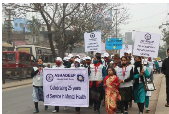
Walkathon to celebrate 25 th Year of Ashadeep