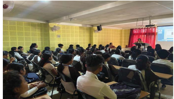
Session on Positive Mental Health with the students of Bikali College