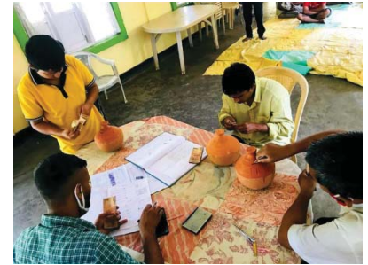
Residents receiving incentives