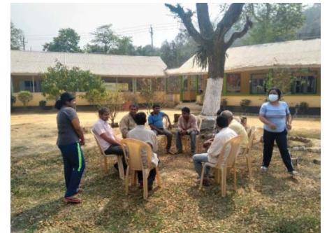
Group Session by Interns