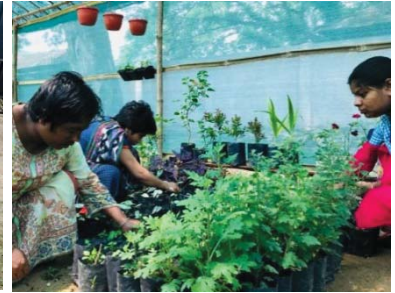
"HAPPY PETALS" – the nursery of the residents