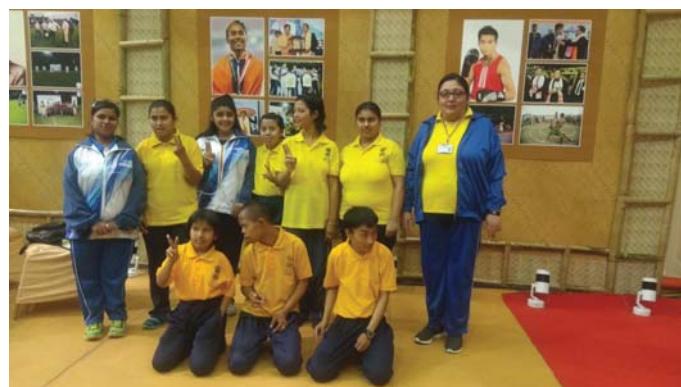
Athletes of ADRC who received Sports Incentive from Directorate of Sports