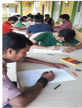
Art Competition amongst Residents