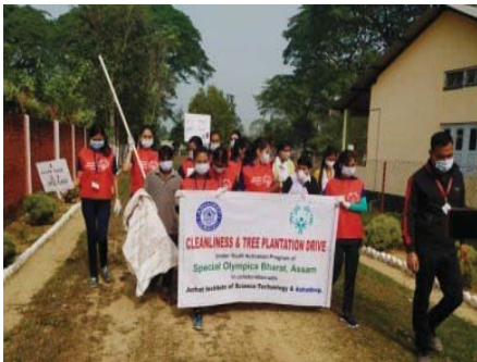
Cleanliness drive by Interns