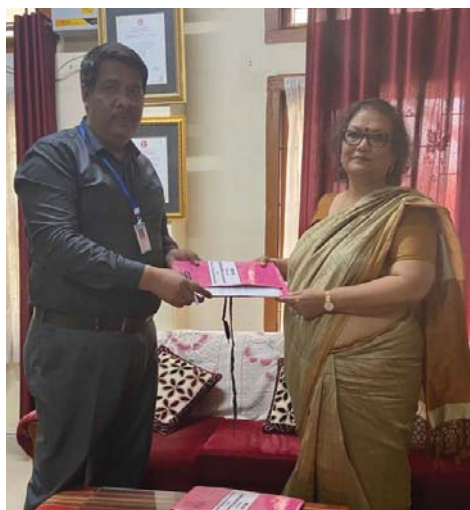
The MoU signed between Ashadeep and Bikali College for counseling session for its students