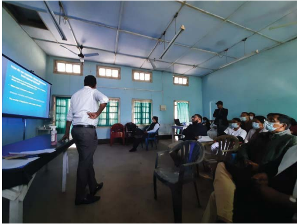
Training of PHC Doctors