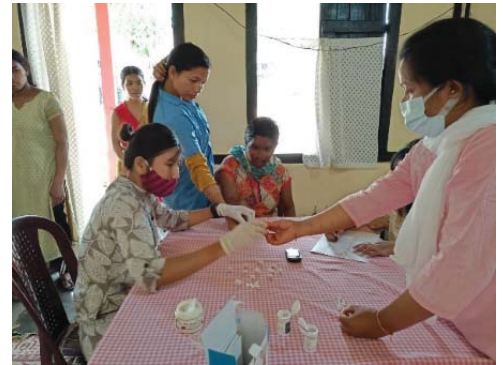
Checking of Blood Sugar level organized by JCI Queens