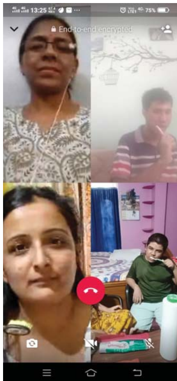
An online session on self help skill training – ‘brushing teeth’