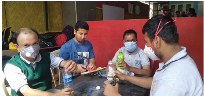
Training on Eco Brick making