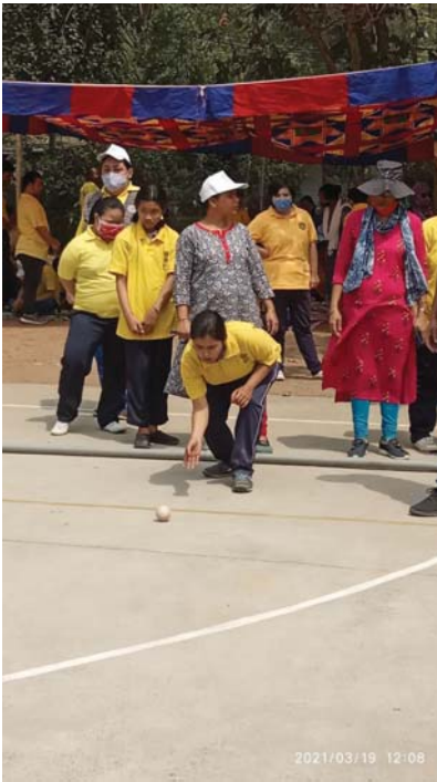
Annual Sports day