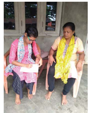
Home Visits by Community Health Workers